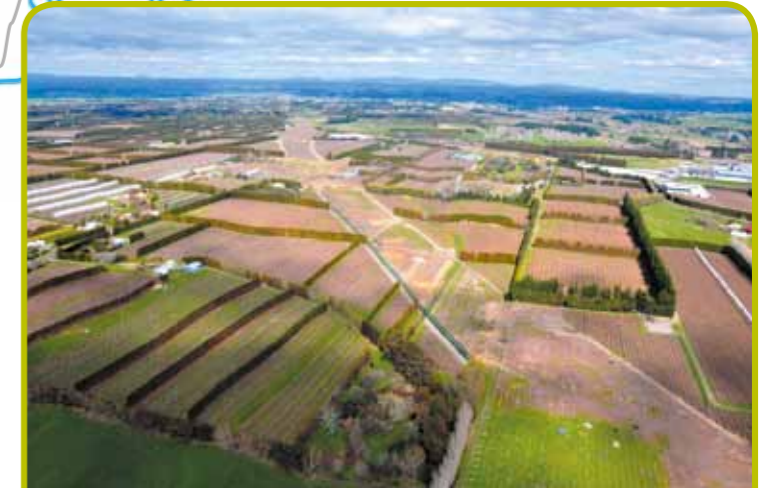
8 Kiwifruit orchard reconfiguration at Paengaroa end of TEL