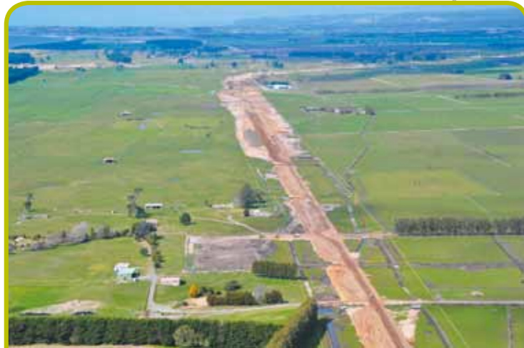
5 TEL alignment heading east towards Kaituna River