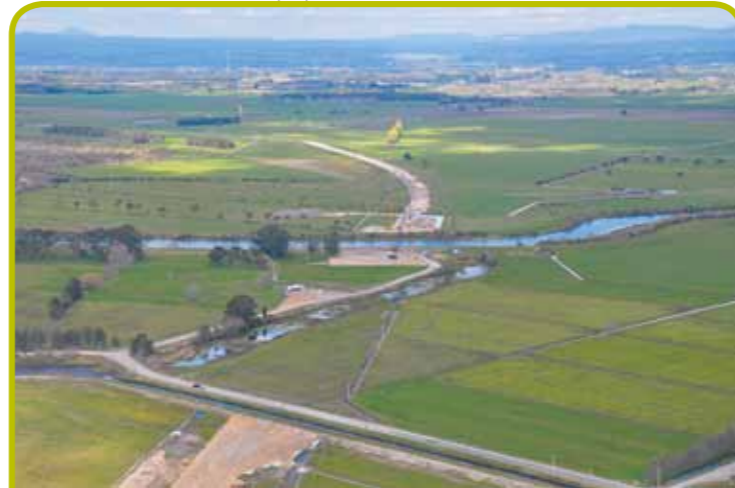
6 Location where TEL crosses Kaituna River heading east towards Paengaroa