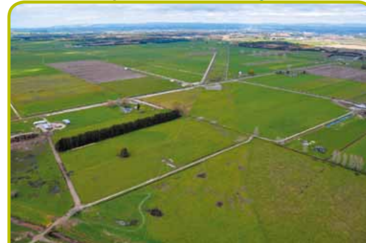
7 TEL alignment crossing Pah Road heading east to Paengaroa