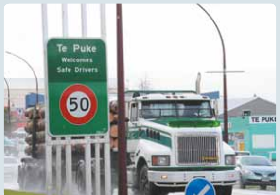
Currently 21,000 vehicles travel through Te Puke per day – the TEL will divert heavy vehicles away from the town centre.